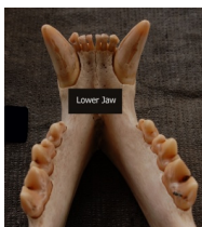
7. Lower jaw showing all the teeth and chipping of the enamel ridge on the back of the canines.