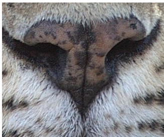
4. Close up of the nose clearly showing the pigmentation.