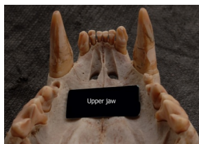
8. Upper jaw showing all the teeth and chipping of the enamel ridge on the back of the canines.