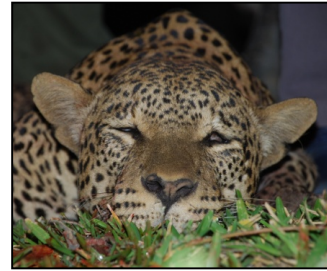
3. Frontal view of the face showing the condition and position of the ears, and facial scarring.