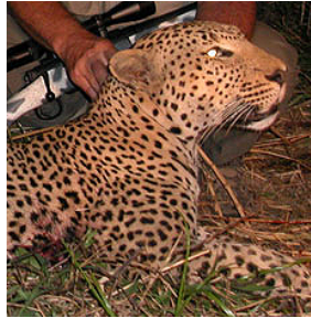
2. Side view of the head (which must be lifted) and shoulders, showing neck circumference and dewlap development.