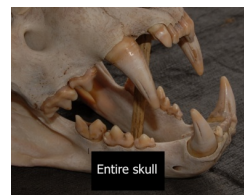
10. Wide shot of all the teeth showing wear, broken teeth, and teeth coloration.

Ensure all data are accurate and no blank spaces are left. Page 1 must be completed even if a leopard hunt was unsuccessful. Ensure GPS coordinates are provided throughout.