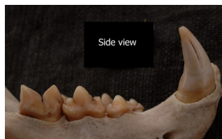
9: Side view of the lower jaw (either side) showing the canine and wear on the cusps of molars and premolars.