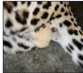
6. Hindquarters clearly showing the presence or absence of a scrotum.