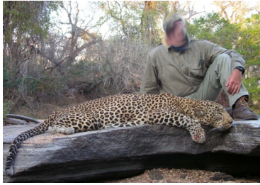
1. Side view showing the entire body with the hunter positioned directly behind for scale. Useful for assessing body size and condition.